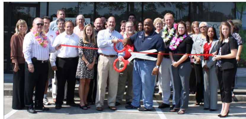
Pictured Left: Beaumont Chamber of Commerce Ribbon Cutting.