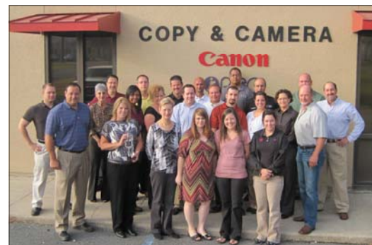
Pictured left: the staff of Copy & Camera Technologies - Lafayette office.

Copy and Camera Technologies was awarded the "Outstanding Partner Award" in recognition of their accomplishments for 2010 by Canon, U.S.A. This is Canon's highest dealer award and is presented to those dealers who have achieved year over year growth equal or greater than 25%.