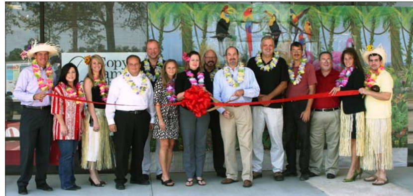
Pictured Left: Lumberton Chamber of Commerce Ribbon Cutting.

Copy & Camera Technologies recently held ribbon cuttings with the Beaumont and Lumberton Chambers and a product show to showcase Canon's newest product line - the imageRunner Advance Series.