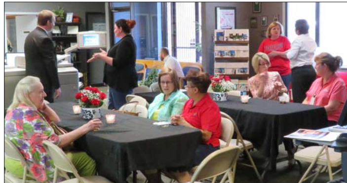
Session three luncheon and meet and greet