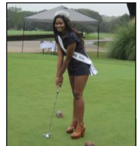
Miss Louisiana USA 2016 Maaliyah Papillion